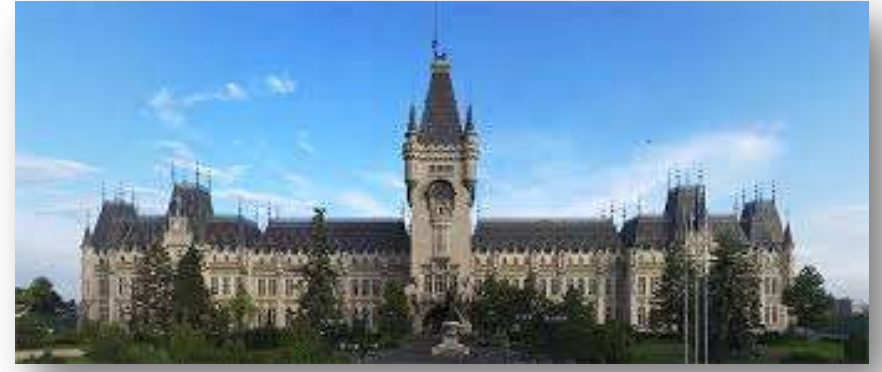
The Palace of Culture

A rich cultural heritage represented by an impressive number of religious and secular monuments (churches, monasteries, palaces, statues etc.)