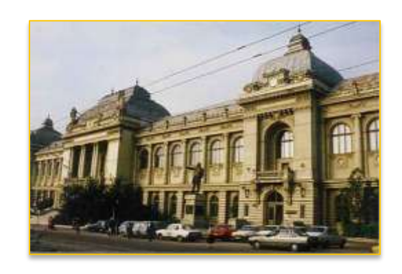
"Al. I. Cuza university "founded in 1860, the oldest in the country

✓ Iasi is one of the oldest and largest university centre in Romania. Currently more than 60,000 students are attending classes of five state universities and five private ones .