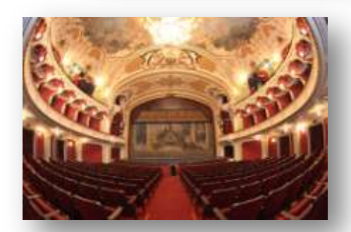
National Theatre "Vasile Alecsandri"